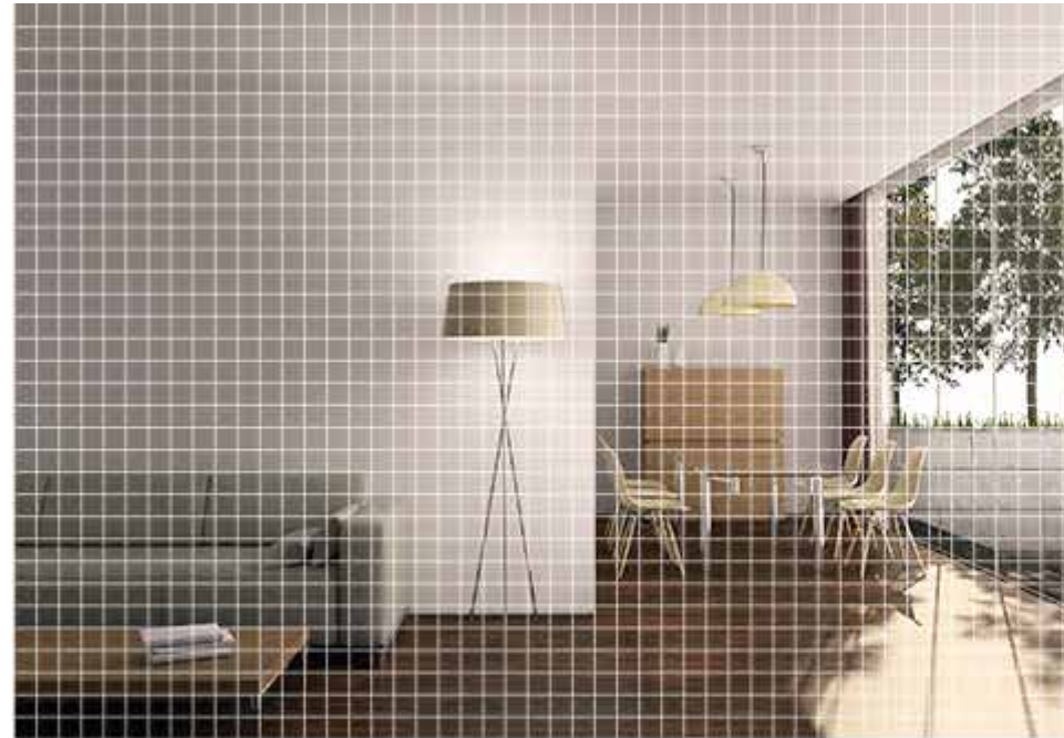
H.264 (Mainstream video compression)

The X5S provides faster video streaming and stores more footage than ever thanks to H.265 video compression technology.